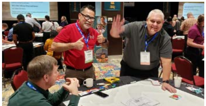
2022 Golden Circle Recipients